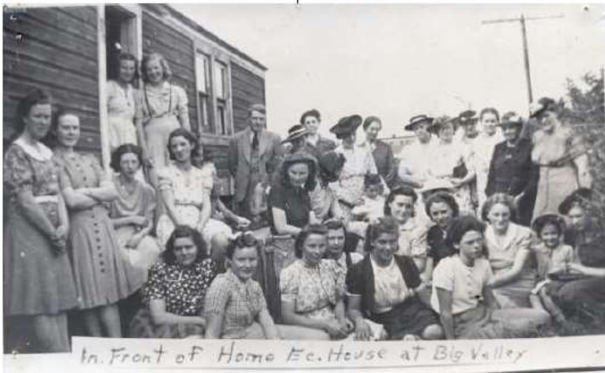
In. Front of Home Ec. House at Big Valley